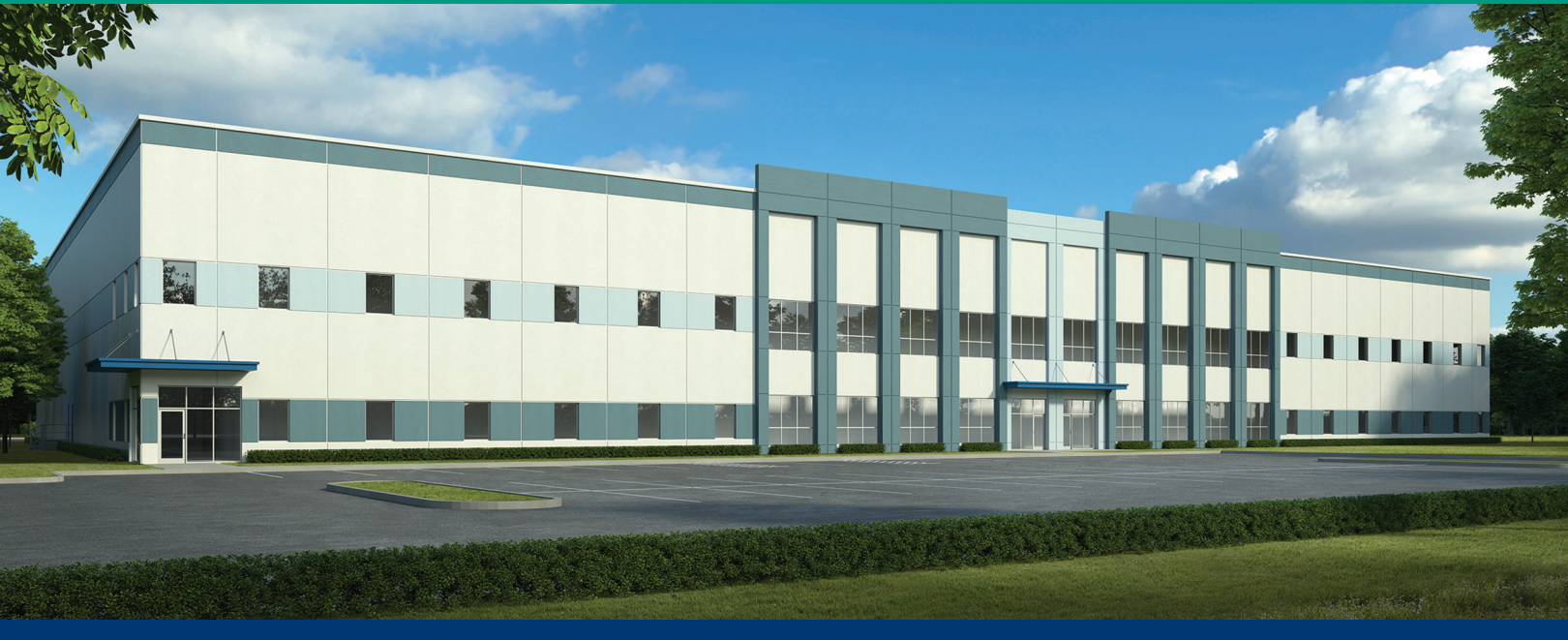
2001 US Route 130, Florence Township, Burlington County, NJ

APPROX. 71,280 Sq. Ft. on 5.68 Acres • WILL DIVIDE